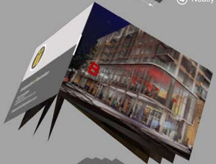
⑥ Fold and Go!