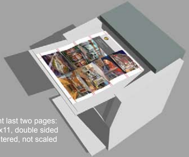
② Print last two pages: 8.5x11, double sided centered, not scaled