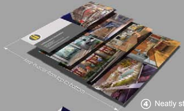
④ Neatly stack