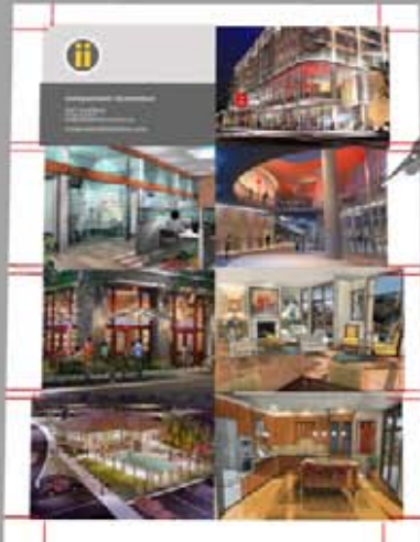
③ Cut on red lines (start with horizontals).